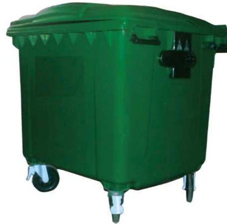
Wheel Waste Bin 1100 LT