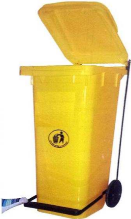
Wheel Waste Bin 120 LT & 240 LT

CONTAINERS, CRATES, INSULATED ICE-BOXES, PALLETS & UNBREAKABLE BUCKET - GHAMELA