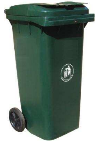
Wheel Waste Bin 240 LT