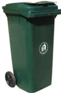
Wheel Waste Bin 120 LT